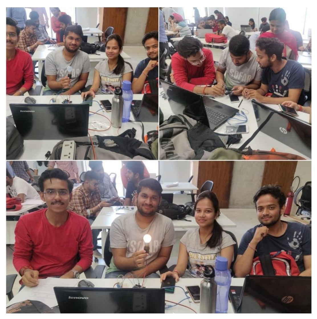
Figure 4. Students involved in IoT: Internet of Things.

Over the past 5 years, a continuous effort to inculcate best practices for experimentation, design and project execution requires a major flip given to support facilities in different laboratories.