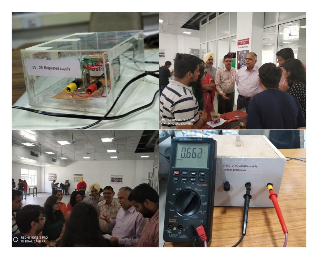
Figure 3. Students involved in DC power supply design.

Many more such experiential activities are lined up for all I^{st} - V^{th} Semester BE ECE and ENC students to give them Hands-On-Training as well as experience of real life field problems and applications. Few glimpses of the experiential learning centre events held at DECE are shown in Fig. 3-4 . These activities do not contribute to the total credits earned, rather are an initiative to inculcate team spirit and make students learn to design, fabricate and commission a real world problem while working in a team. This puts the students in a practice to do more similar projects (e.g. Capstone project, group design project, project semester) in their latter part of the curriculum.